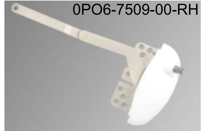
Right Hand X Drive CRS Split Arm Operator with Vinyl Base