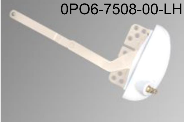
Left Hand X Drive CRS Split Arm Operator with Vinyl Base