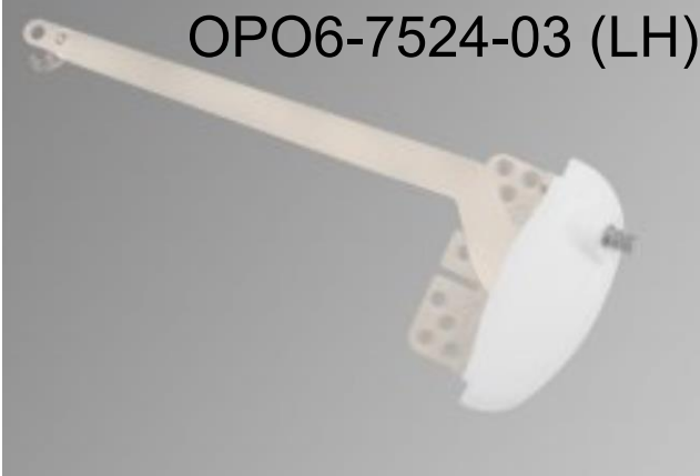
9.5" Left Hand X Drive CRS Single Arm Oper. with Vinyl Base