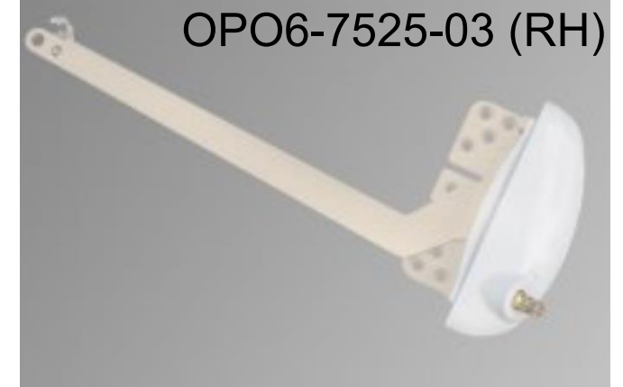
9.5" Right Hand X Drive CRS Single Arm Oper. with Vinyl Base