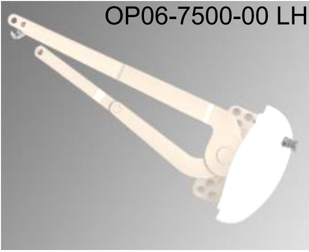
Left Hand X Drive CRS Dual Arm Operator with Vinyl Base